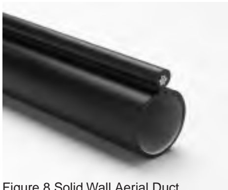
Figure 8 Solid Wall Aerial Duct