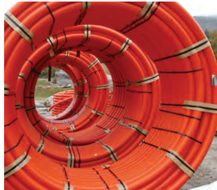
Large diameter coil