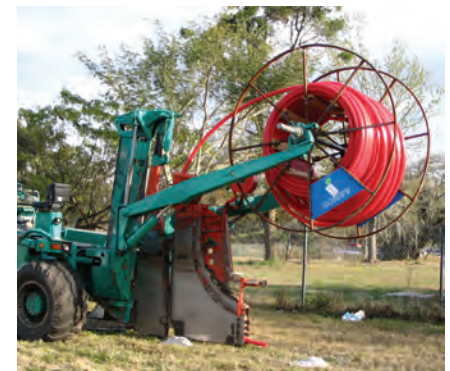
Plow chute installation